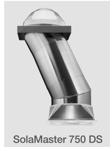
SolaMaster 750 DS

Thirty-one SolaMaster 750 DS systems were utilized in larger classrooms, kitchen spaces and open offices. The SolaMaster 750 DS is designed to deliver consistent light output throughout the day by effectively capturing low-angle rays of light in the morning and late afternoon but rejecting high-angle rays at midday to prevent glare and over-lighting.