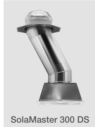
SolaMaster 300 DS

Eighteen SolaMaster 300 DS systems were installed in smaller classrooms. The SolaMaster 300 DS was a great solution for the smaller interior classrooms as they are designed for small spaces and lower ceilings that have a hard or suspended ceiling system. All Solatube products were equipped with a 0-10V daylight dimmer which allows the staff members to fully control the amount of daylight in the room. The SolaMaster 300 DS were also fitted with Thermal Insulation Panels to provide additional thermal performance with a lower U-factor against the central Minnesota climate.