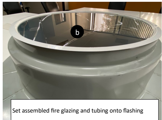
Set assembled fire glazing and tubing onto flashing

Complete installation process, including dome and tube installation per Solatube SolaMaster Series Installation Instructions P/N: 950160.